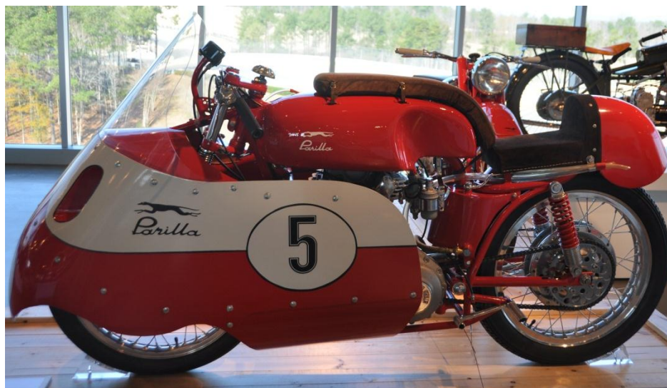
Greyhounds just aren't for buses -- logo on an Italian motorcycle made by Parilla. On display at the Barber Motorsports Museum .