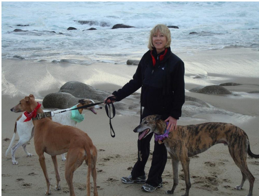
Happy Pappy.

We wish our new adoptees much love, lots of long walks, and a cushy bed for long, winter naps! Thanks to all for giving these retired racers a good home!